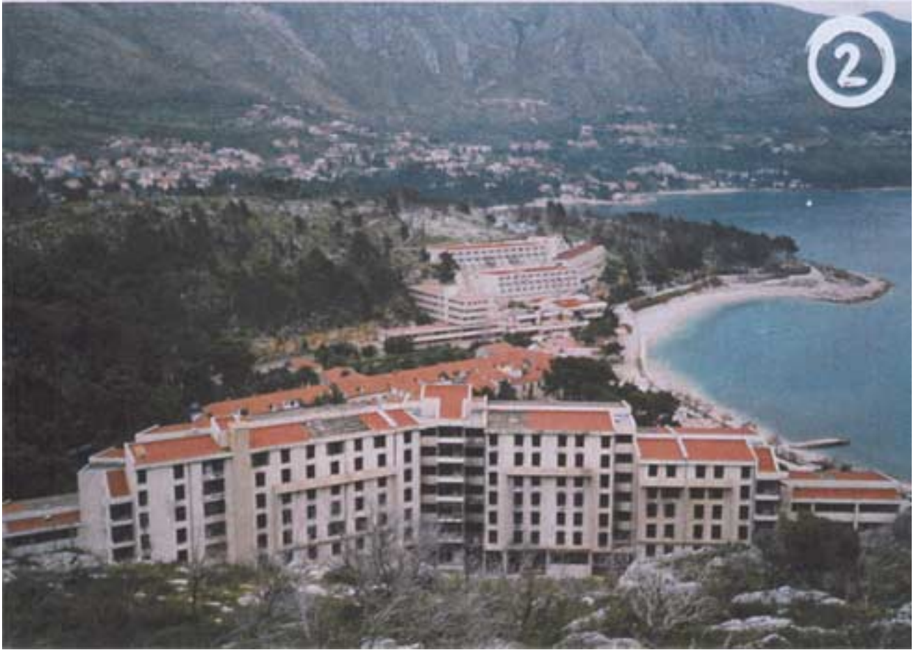
Picture 2: Hotel Goricina I Hotel Goricina II (center) Hotel Kupari (bottom)