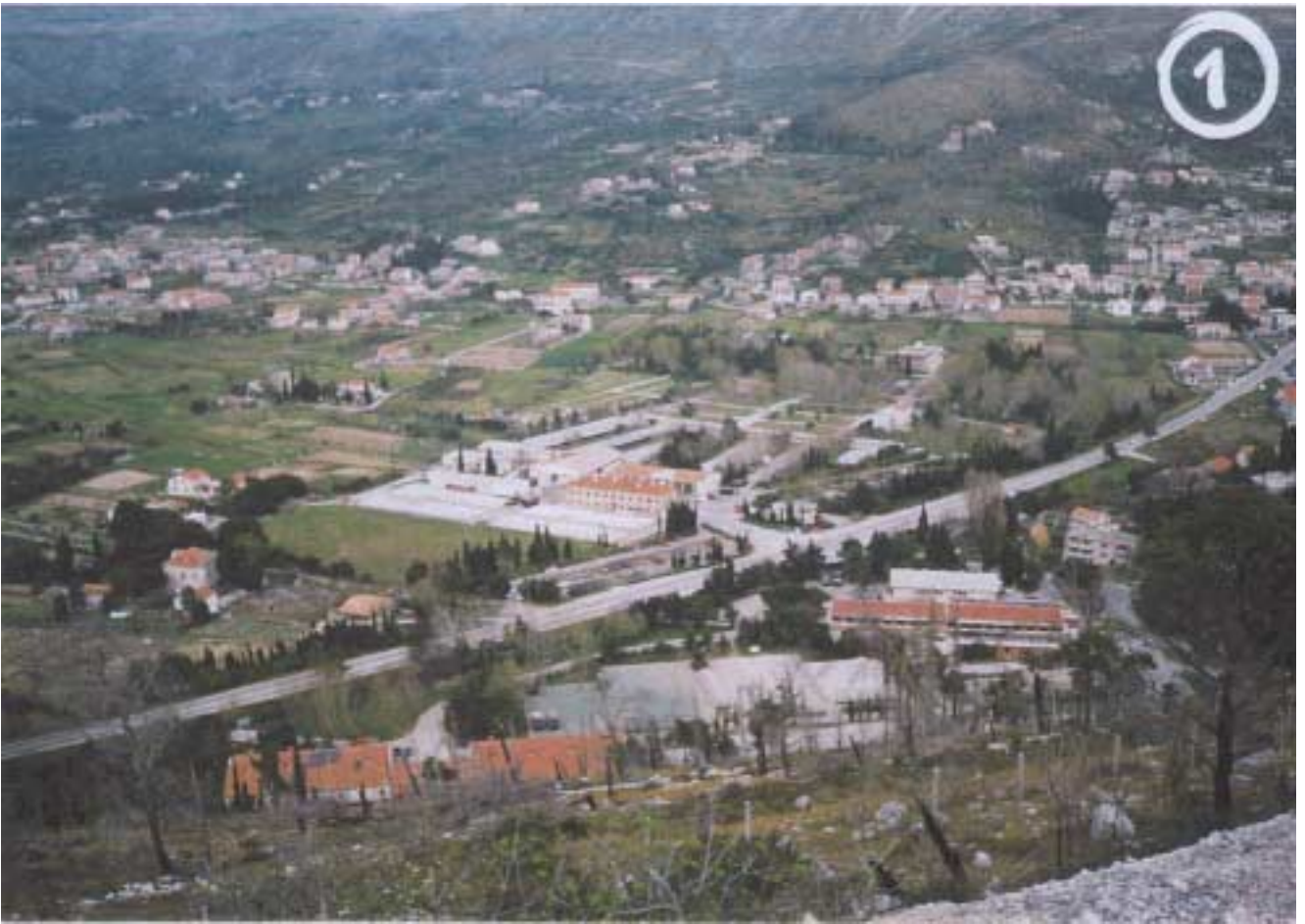
Picture 1: Hotel Mladost (right bottom) Camp and servicing zone (center to right top)